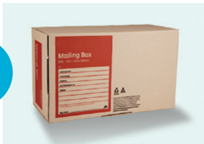
Place in suitable packaging