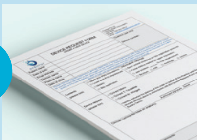
Device request form