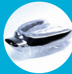
O 2 Vent™ T