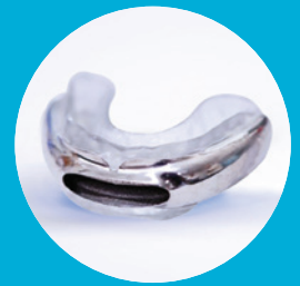
O 2 Vent™ Mono