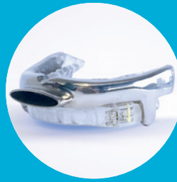
O 2 Vent™ W