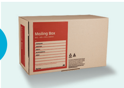
Place in suitable packaging