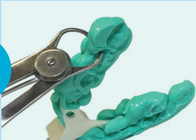
Calipers measuring the bite