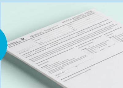
Device request form