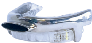
O 2 Vent W device with titanium airway and polymer inserts